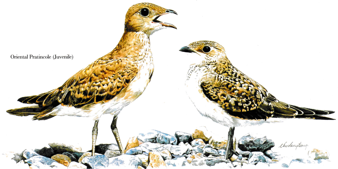
Oriental Pratincole (Juvenile)