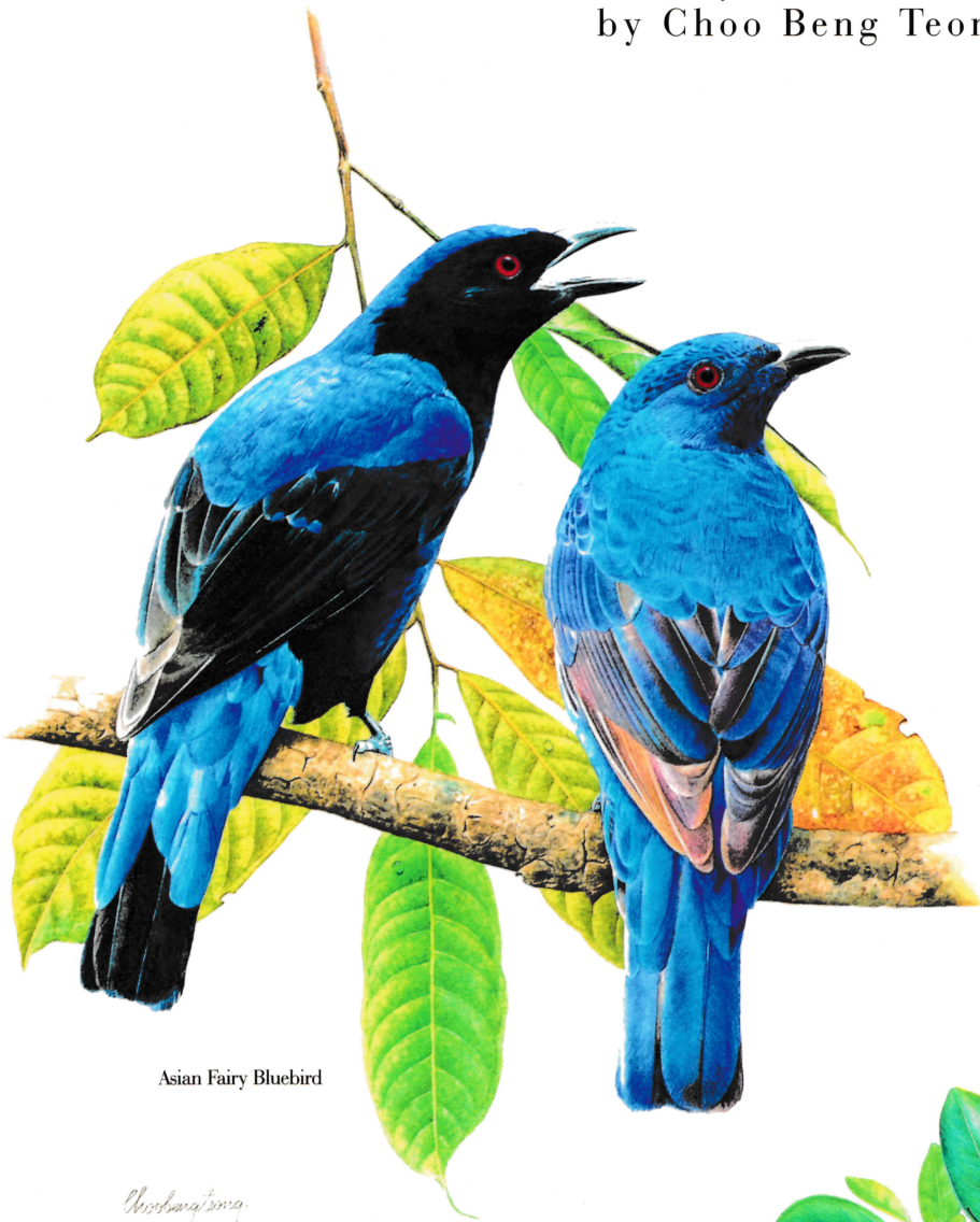
Asian Fairy Bluebird