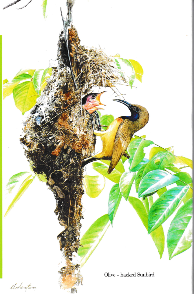
Olive - backed Sunbird

The collection includes birds such as the shore-based Common Sandpiper, Goldenback Woodpeckers found in mangrove swamps, Fairy Bluebirds and Pink-necked Pigeons in rainforests to the Silver-eared Mesia and Fire-tufted Barbet in montane rainforests - well over 20 masterpieces in all.