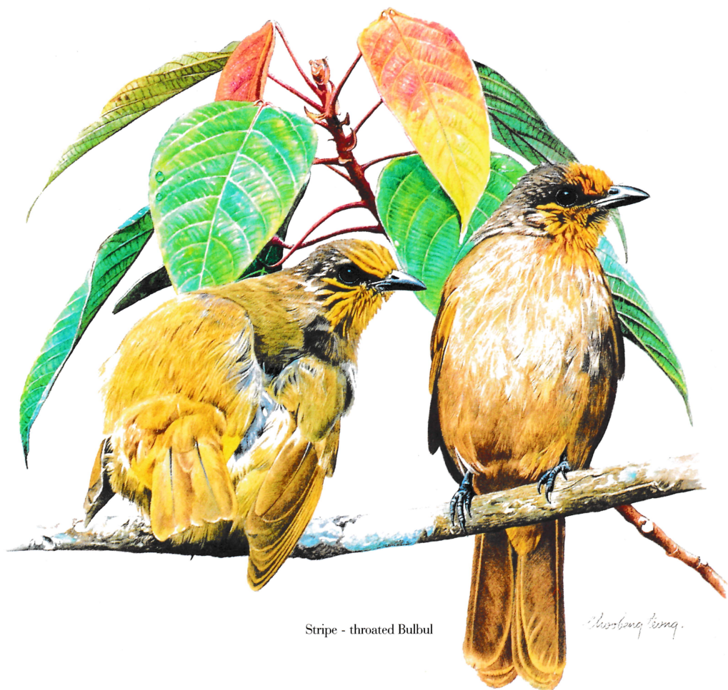
Stripe - throated Bulbul

While paintings are generally viewed and appreciated from a distance, Choo's watercolour creations beckon you to do the exact opposite. Come up close...very close and you will discover why his work has gained such critical acclaim. Detail within details; delicate colours and textures on each feather, dew drops on a leaf, an ant scurrying away on a twig, the subtle interplay of light and shadow - all recorded with excruciating depth and clarity.