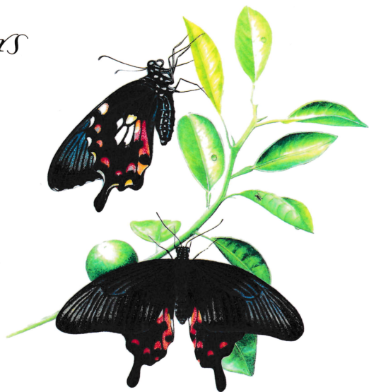
Moy Siew Ting

Fuelled by her passion for these winged beauties, especially many endangered species facing possible extinction; Moy hopes to heighten public awareness and nature conservation through her paintings.