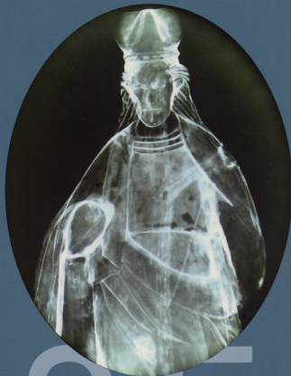
ALL IMAGES PRESENTED HERE ARE PART OF THE ARTWORK, HALLOW , 2012, X-RAY IN FRAMED LIGHTBOXES, SIZE VARIABLE