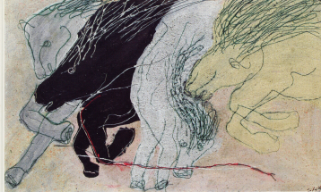
4 TENAGA KUDA, 2008, mix media on canvas, 75 x 120 cm