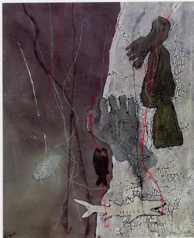
MUSIM PANJANG II, 2008, mixed media on canvas, 150 x 120 cm

front cover: BANGKIT (WAKE UP), 2008, acrylic on canvas, 132 x 132 cm