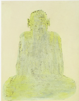
SOSOK, 2008, acrylic on canvas, 150 x 120 cm