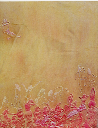
GADIS PANTAI II, 2008, acrylic on canvas, 140 x 115 cm