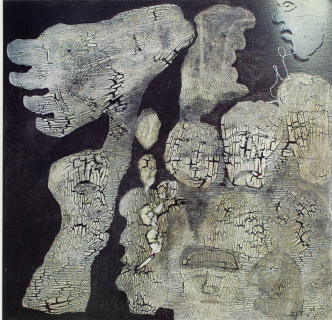
KEPALA KAKI II, 2008, acrylic on canvas, 100 x 100 cm

But whilst he brims with confidence for the human spirit, as reflected in the strong line and dynamic spirit of his images, Stefan nevertheless betrays a healthy grip on reality. Indonesia's vibrant new democracy will face an election this year, and to celebrate the new forces of populism he senses around him, he characterizes the politicians fishing for votes in the murky depths of the ocean. Using a creative combination of ink-stained string and sawdust, he conjures up the many faces of voters in a parody of communal unity, their variety presenting at once the impossibility of uniformity. That's democracy for you, he says.