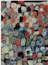
PIKADA RAKYAT BANTUL, 2008, mix media on canvas, 200 x 150 cm