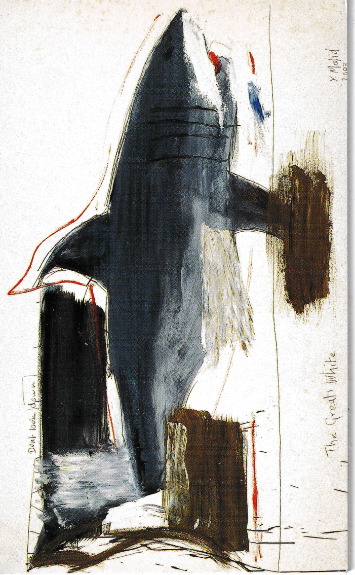
The Great White